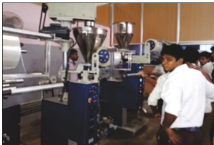
Students observing the incubation projects