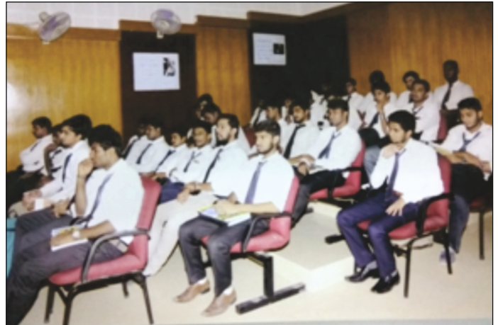
Students attending the workshop on Incubation of Business Ideas