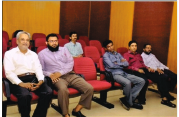
The participants of MDP" Creating a Culture of Excellence"

He made the participants to realize the need and importance of moving towards the culture of excellence from the normal level along with the problems while implementing the same. He also motivated the participants by elaborately discussed about the benefits of having excellence at work place. The MDP was successful and it received a good response from the participants.