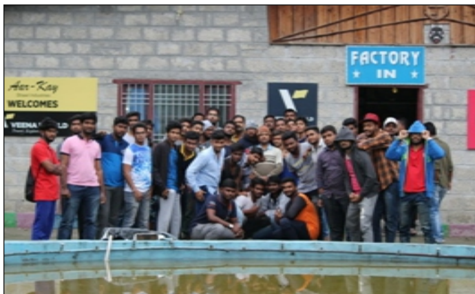
Industrial Visit to Shawl factory at KulluSight Seeing in Rohtang pass Manali