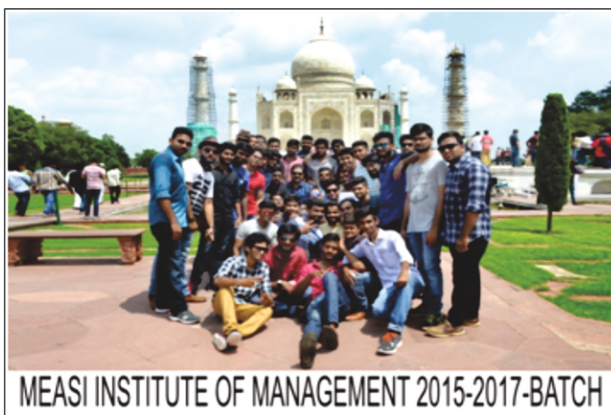
MEASI INSTITUTE OF MANAGEMENT 2015-2017-BATCH