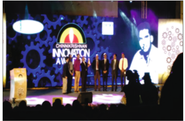
MEASI Students at MMA 5thChinnikrishnan Innovation Award Function 2016

As a part of the MMA Students' Chapter activity, MMA has given enormous opportunities to our students.