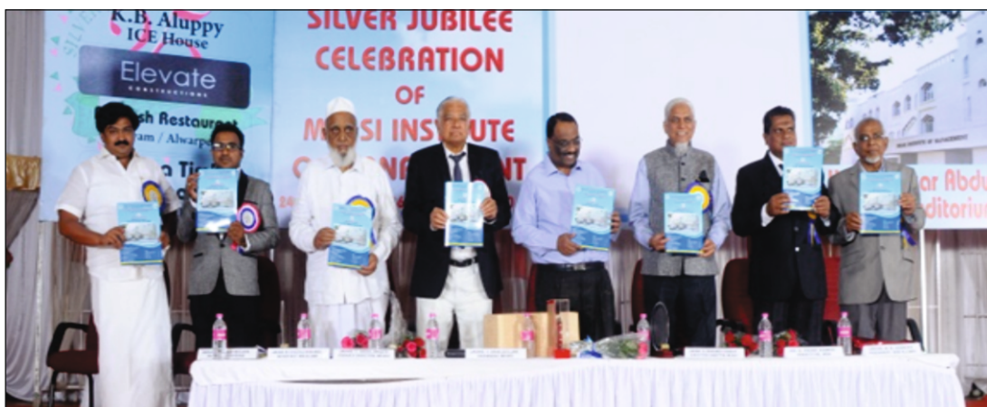
The Dignitaries with the Silver Jubilee souvenir

A number of events were held together with a photo exhibition displaying the pictures of various events through the 25 years journey of MIM. It was a very nostalgic event each one was traveled back to their college days and recollected their golden memories.