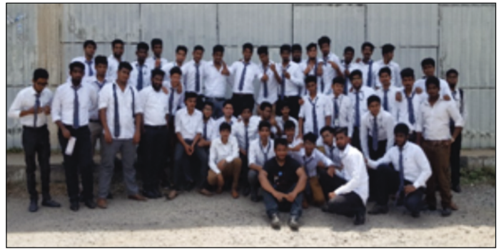
MEASI Students at Hatsun Agro Foods

Finally it was the cooler room the temperature was Below 5°C. lastly we were taken to packing process section there we learnt about effective packing to preserve the Hatsun products and the printing of Manufacturing and expiry dates. We were also complimented by Hatsun complimentary bag and icecreams. We thank the coordinators for their support and MEASI institute of management for organizing such an enlightening Industrial visit.