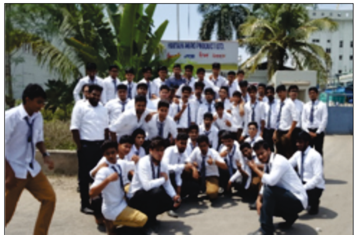
MEASI Students at Hatsun Agro Product limited, Kancheepuram