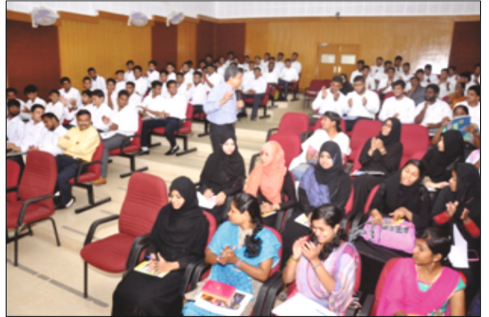
Our students at MMA workshop