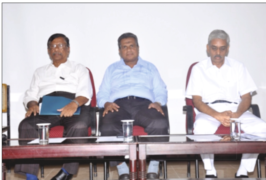
Our Director with the Chief Guests during AZAADI 70 Celebrations