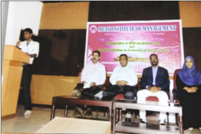
At the inaugural of the Incubation Centre

The workshop was divided into four sessions, the students were divided into seven teams, first session was about conceiving the business ideas, the second session was about discussing the ideas, in the third session students presented their ideas and in the fourth session the students' ideas were evaluated for their practicality and viability. The business idea of manufacturing “coconut shell”, a tetra pack coconut water drink was selected as the best Business idea by the resource person.