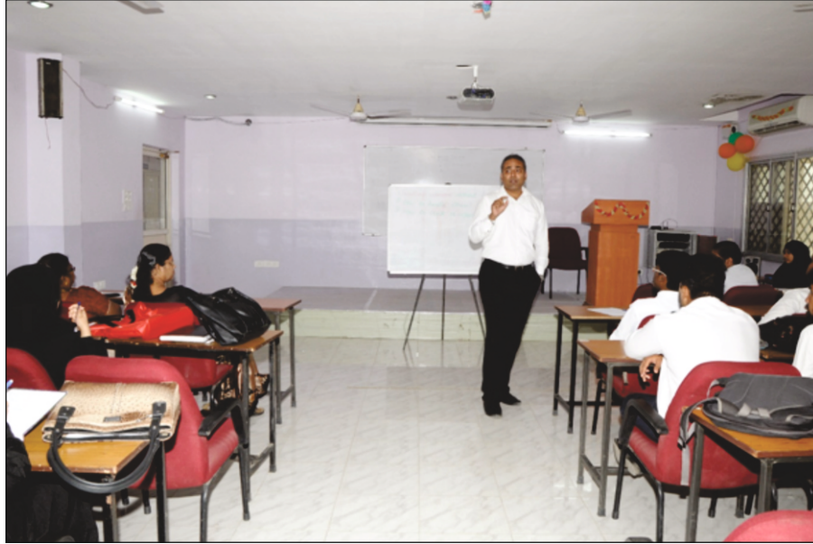
Resource person interacting with the students

The program emphasized on the behavior to be adopted in the interview, Mannerism and approach to be followed by the students in an interview. It also highlighted on what sort of questions will be asked and how such questions can be dealt in an interview. Our final year students were highly benefitted by the seminar and expressed that they are confident in attending the interviews and they will be well placed.