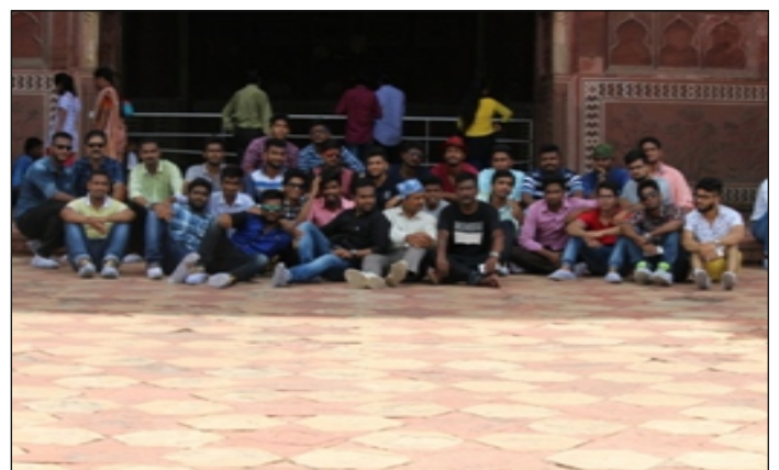
At Agra fort and Red fort along with staff members