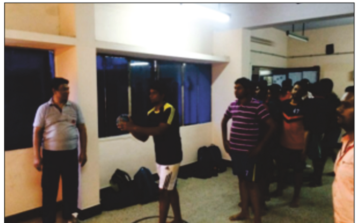
MEASI boys win kabaddi tournament