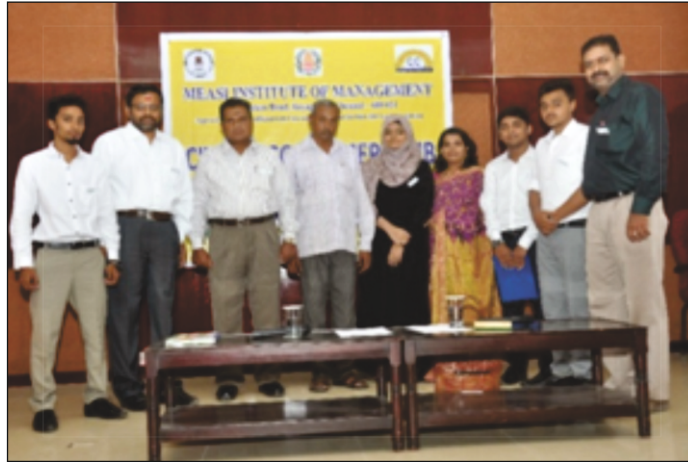
Our CCC club members with Director and the resource persons