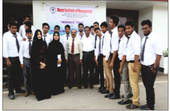
Our students at MMA workshop

7. One Day workshop on “ Winner in You” on 03/11/2016 by Mr. Gp. Capt. Vijayakumar between 10.00 am-11.00 am.