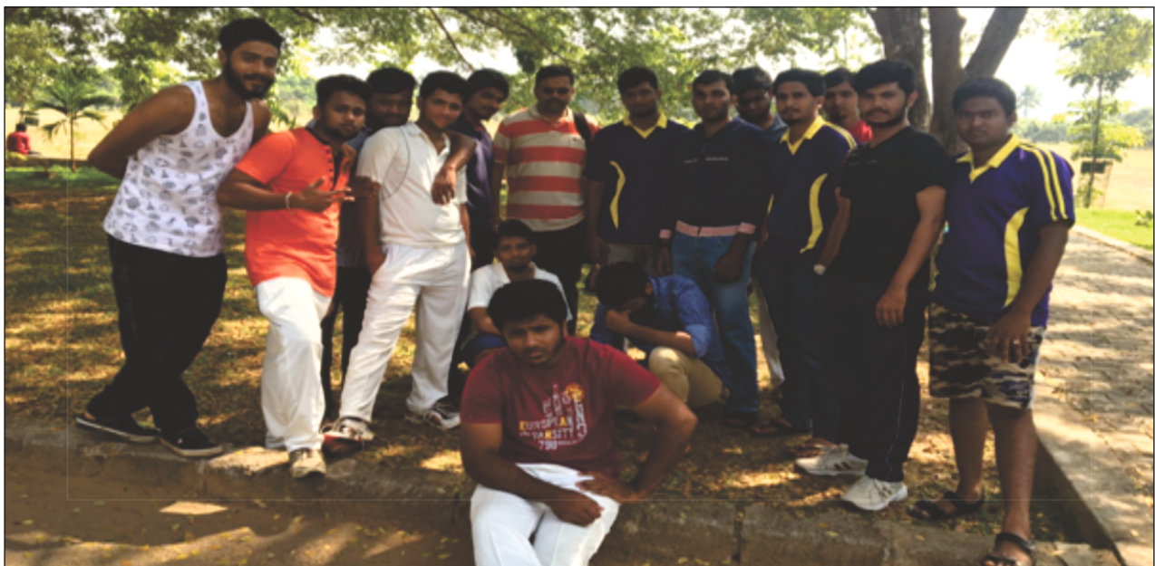
MEASI Students at VIT T 20 cricket tournament

The second year and first MBA students of MIM participated in the RIVERIA 2016 organized by VIT Vellore on 27th January 2016 for the T20 cricket tournament. The tournament consisted of 20 colleges throughout various cities in India and it has been categorized as group A and B. The first inaugural match between Nanda Engineering College, Erode and MIM, Chennai started at 10 am.