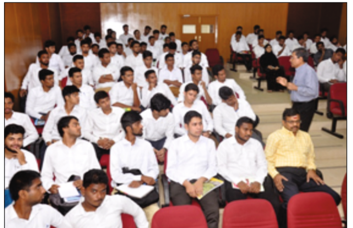
Our students at MMA workshop