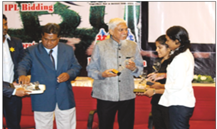
Our Executive Director Distributing the Prizes to the winners of NEWANCE '16

320 competitors from 32 leading Colleges had participated in this mega event. The winners and runners were awarded cash prize of Rs. 5,000 plus trophies and certificates. The Best manager won an APPLE Ipad, sponsored by MEASI Institute of Management.