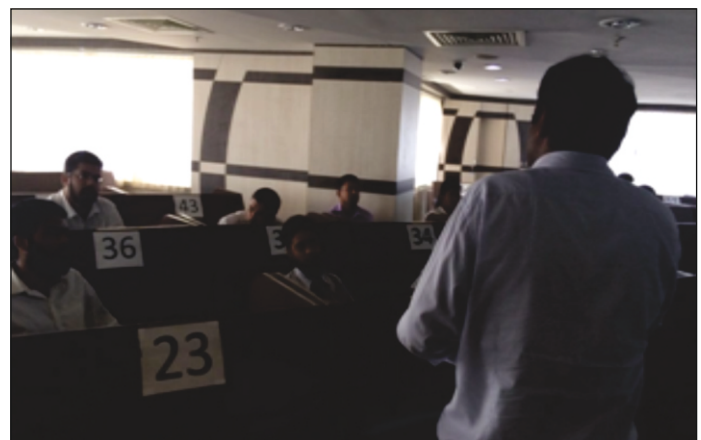
MEASI Students at Investor Planning workshop at SEBI Regional office Chennai ction 2016