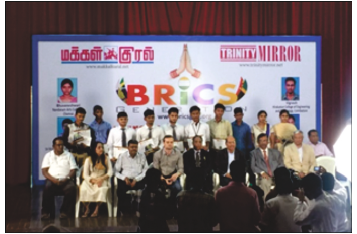
Our student at the BRICS summit