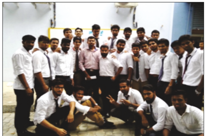
MEASI Students at Live hood Business Incubation Center