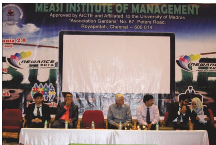
At the Inaugural of NEWANCE '16