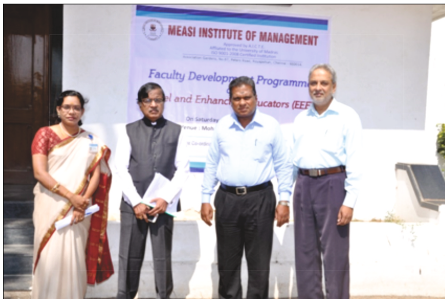
Our Director with the faculty members and the resource person