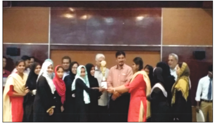
Prize distribution Ceremony of Triumph'16 Annual sports Meet