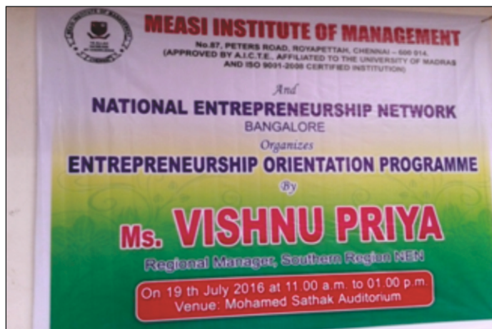
Entrepreneurship Orientation Programme by NEN