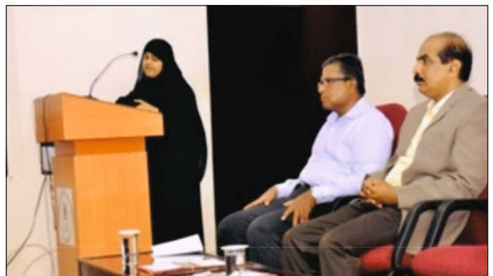
AT The Inaugural of MDP" Creating a Culture of Excellence"