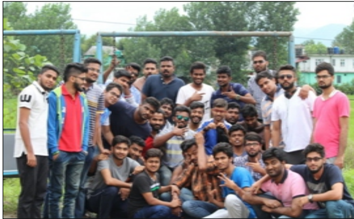
Students in the Kullu valley

diversity we enjoy. There is no country on earth that offers the visual diversities. North India is well equipped with age old monuments, magnificent Himalaya, deep rooted religious beliefs and modern cities all at the same place. The Tour Trip that is a specially designed educational tour to make our students familiar with India's pride.