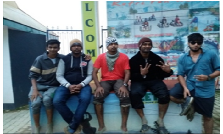
Kufri Fun world theme park in Shimla