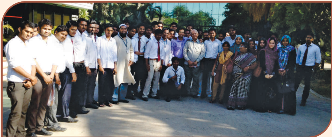
Industrial visit to Rabia Leathers

The students in our institution are not only exposed to theoretical knowledge, but also to the practical knowledge of the widest sense through regular industrial visits every semester. The students are taken to industries for hands on experience. Every visit helps the students in learning the organizational activities. Industrial environment is different from what is learnt in the book. The hands on experience will act as a special subject to the students.