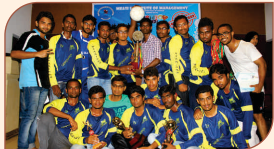
MIM all-round sports Warriors won the title "TRIUMPH 2013"