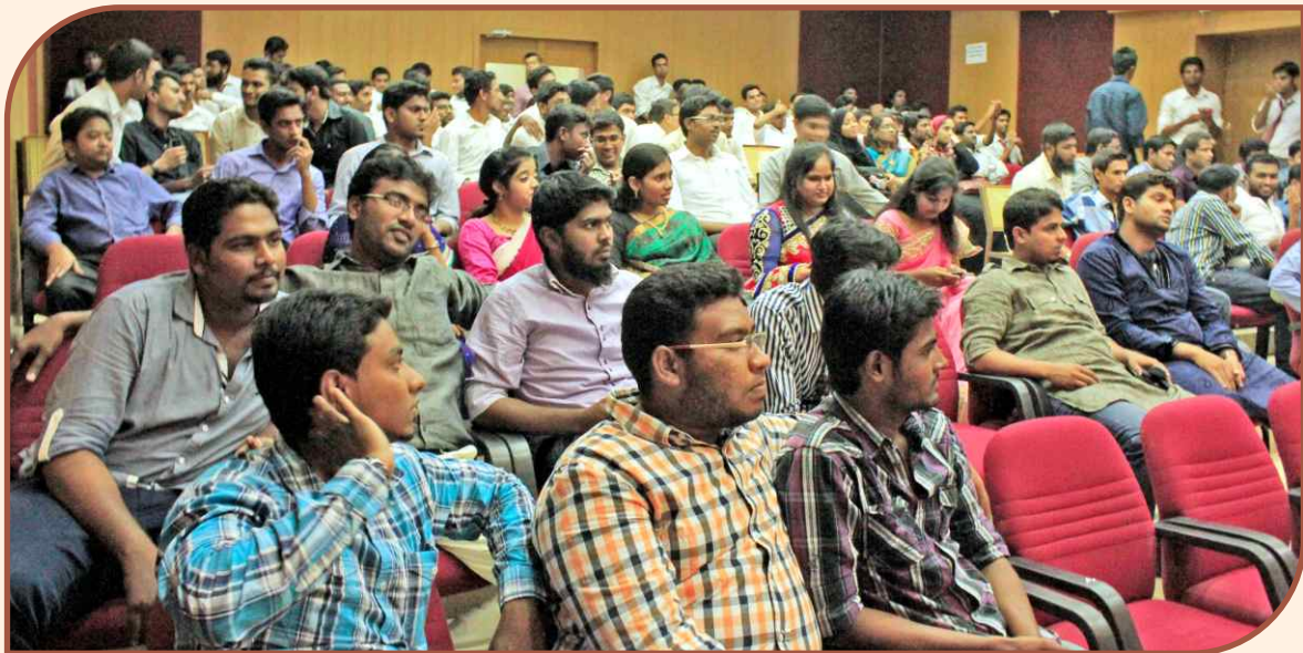
MIM 2011 – 2013 Batch students in Farewell Celebrations