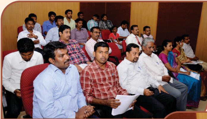
MIM Faculty Members