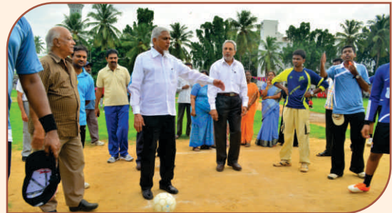
Foot Ball match started by Executive Director