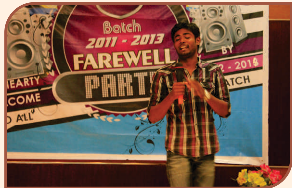
Farewell Celebration in Mohammed Sathak Auditorium, MIM Campus