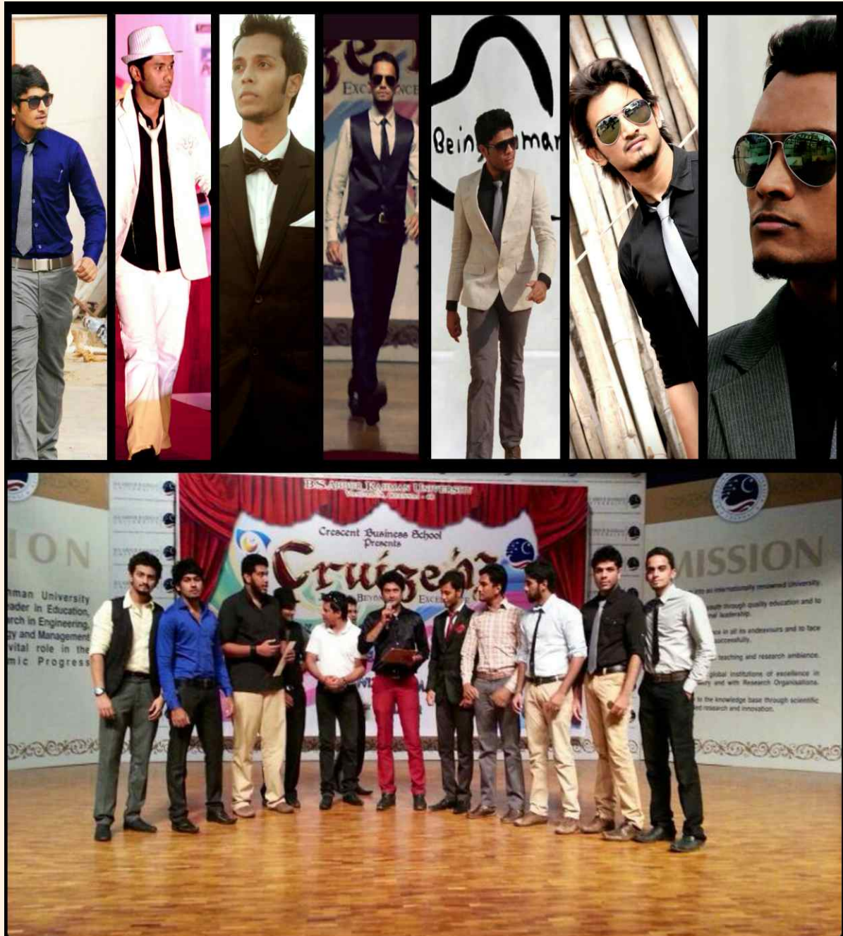
Corporate Walk Winners from MIM Team in Crescent Business School