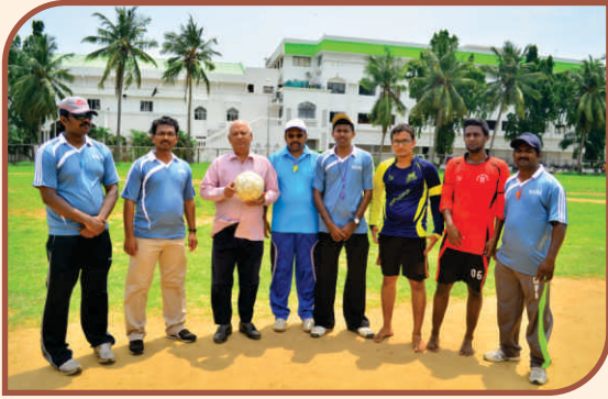
Warriors Vs. Red Rovers Foot Ball Finals