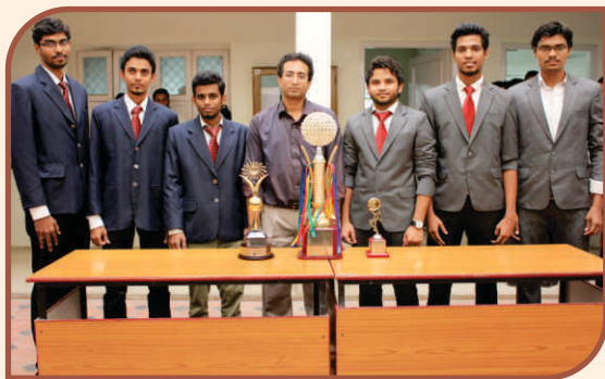
Photo Session of Volleyball Team Captain with Faculty