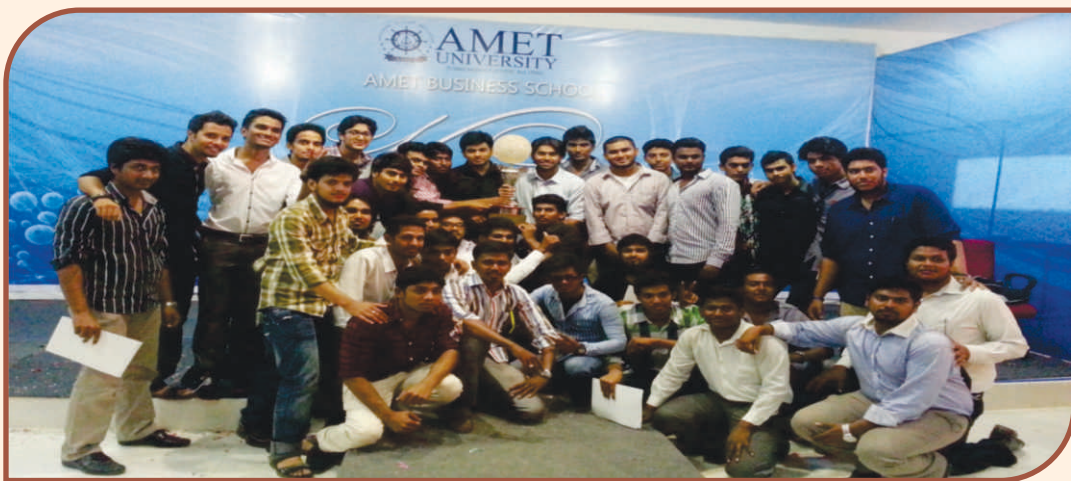
Overall Winners in Management Meet conducted by AMET University

The institute organizes a State Level Management Meet “Newance” every year, which enables the student to learn the art of managing. This acts as a platform for the students to meet the corporate people, and also provides ample opportunity to them to improve their soft skill. The students also attend the management meets conducted by various other colleges. The students have not only participated in competitions but have also won 1st place in competitions organized by many institutions.