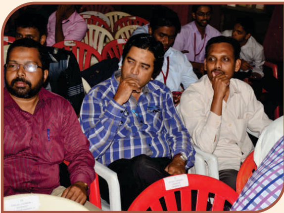
Administrative Staff of MIM