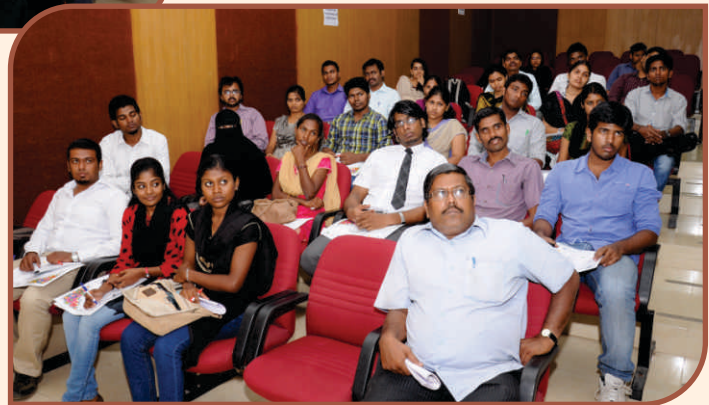
Delegates from other Colleges