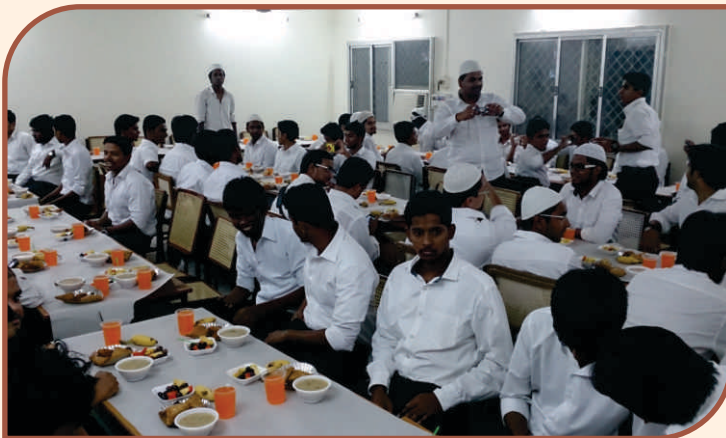
MIM Students in Ifthar Party during Ramzan Occasion