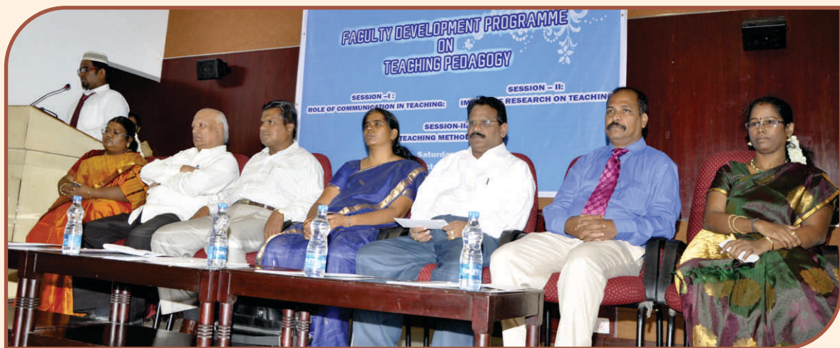
Inauguration of Faculty Development Programme

“Change your thoughts and you change your world” -Norman