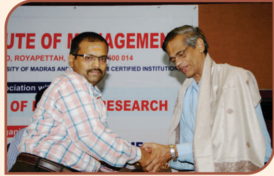
MIM Faculty Members Honouring the Chief Guest with Shawl and Memento