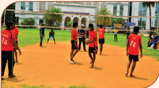
Volley Ball Finals