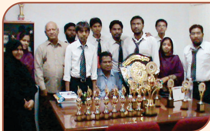
Winners in National Level Meet conducted by DG Vaishnav College with Rolling Trophy

“Your attitude, not your aptitude, will determine you altitude” - Zig Ziglar