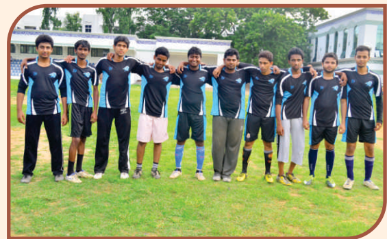
A-rated lineup for Football Match

At the end of the Sports meet prizes were distributed to all winners of the event and the overall champion was announced. Warriors (II year 'C' batch) won the overall championship for the year 2013. Teaching Director, non-teaching Staff extended full support for the smooth and successfully conduct of all events.