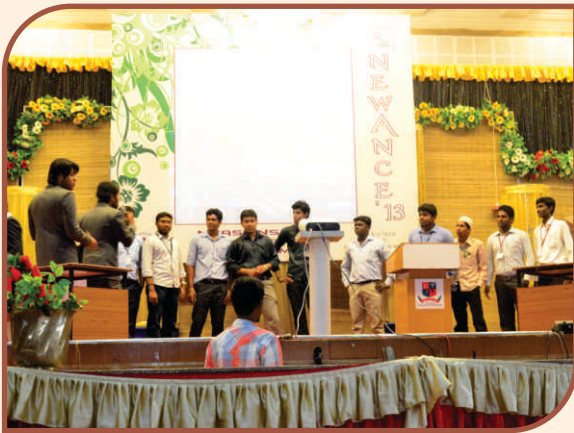
Adzap Finals on Stage Event