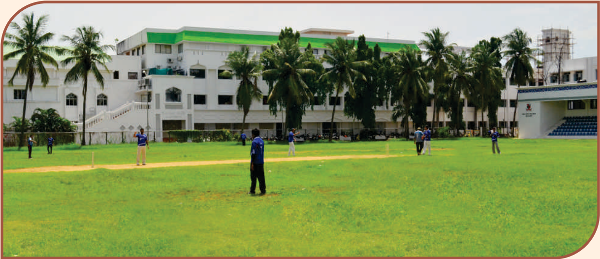
Cricket Match in Triumph 2013