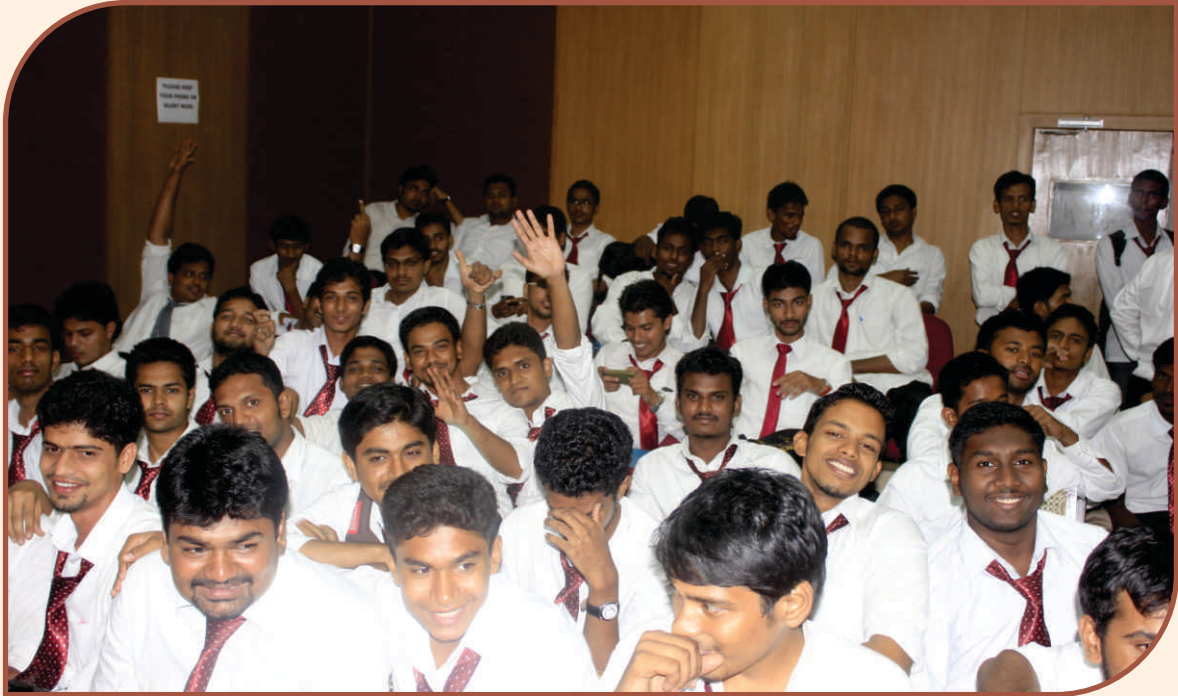
Students participation in Freshers' Day Celebrations