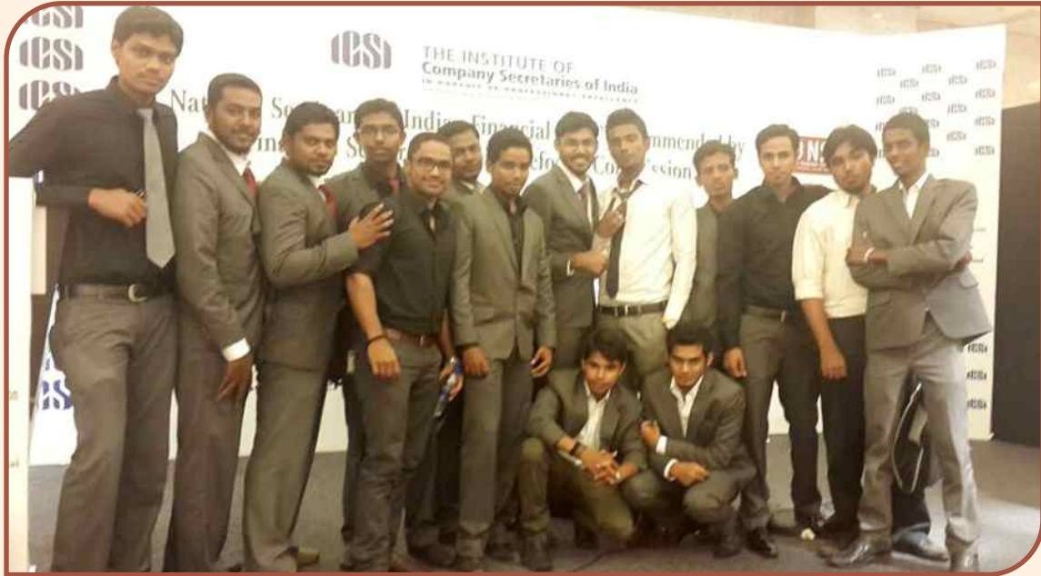
Participated in Seminar organised by The Institute of Company Secretaries of India