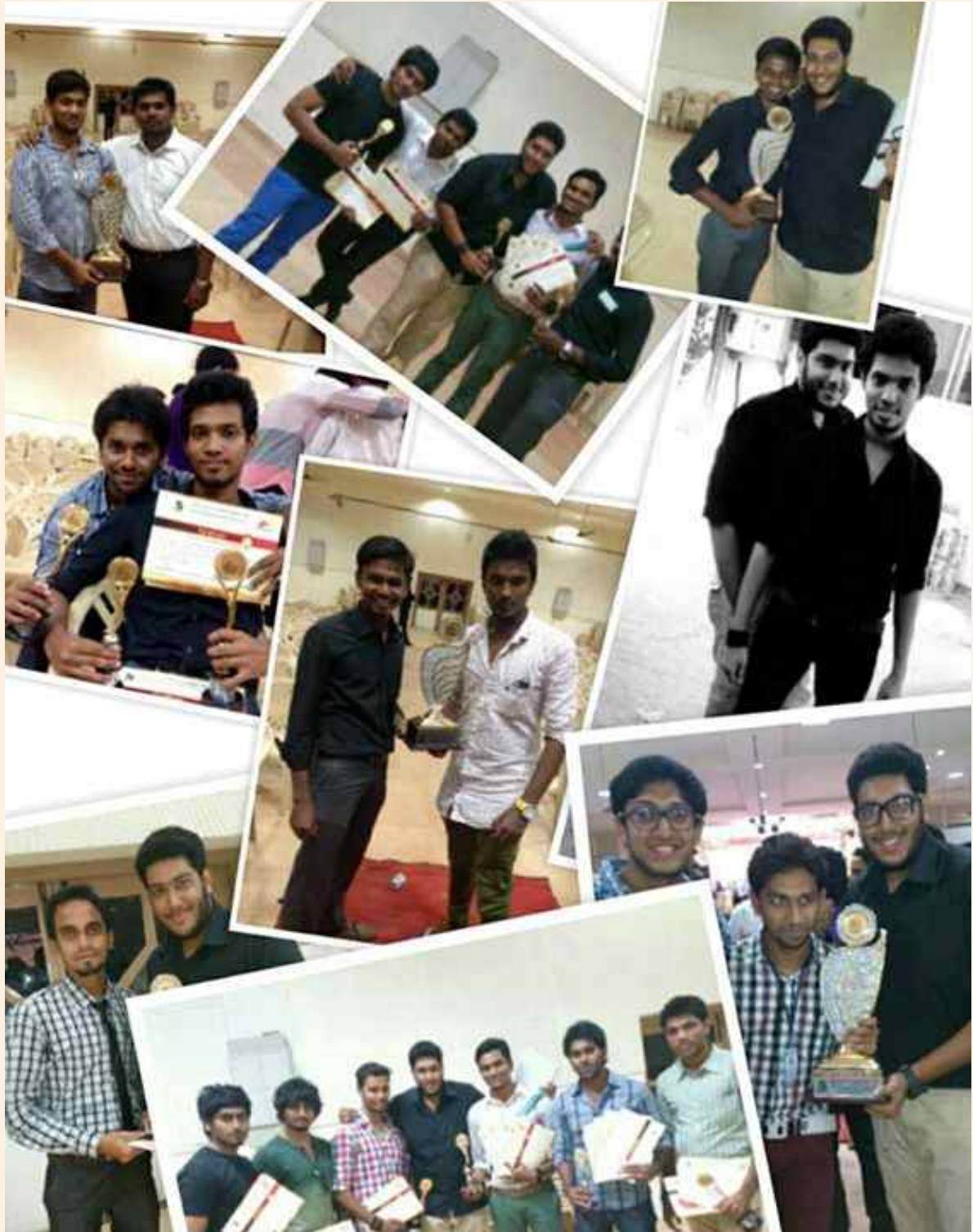
MIM Students won 13 Trophy's in the year 2013

“Winning takes talent, to repeat takes character” - John Wooden