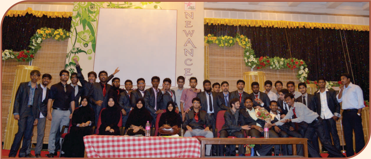
Alumni Students in Newance '13