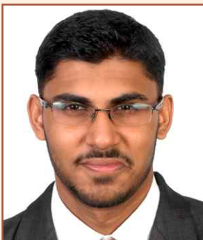
MOHAMMAD RAFI 80.77%