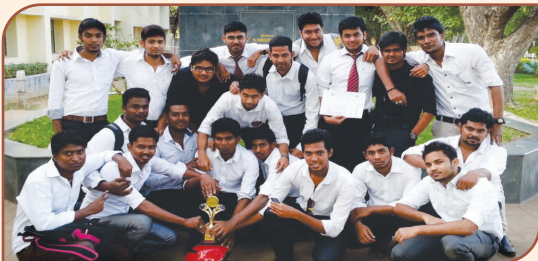
Winners in ASAN Memorial 2013 National Level Meet by MIM Students