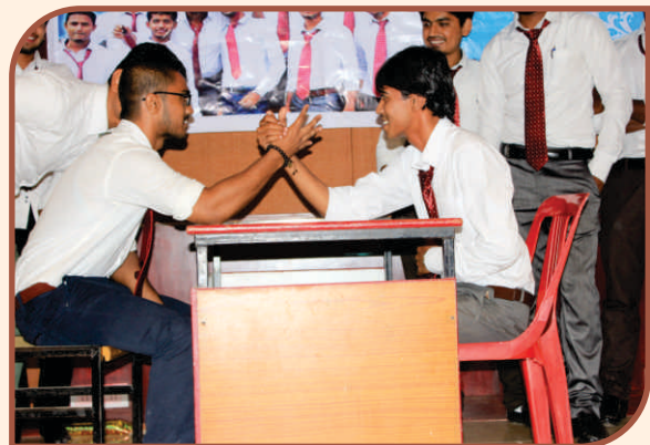
MIM Students Activities in Fresher's Day Celebrations