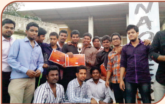
Overall Winners in Asan Memorial College National Level Feast