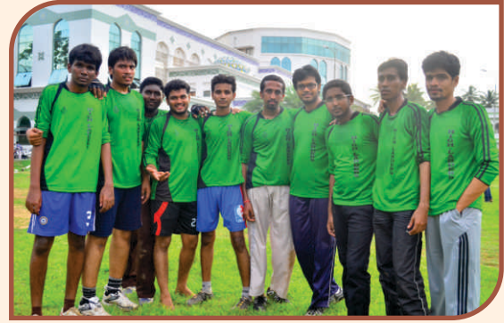
Highlanders Team Members