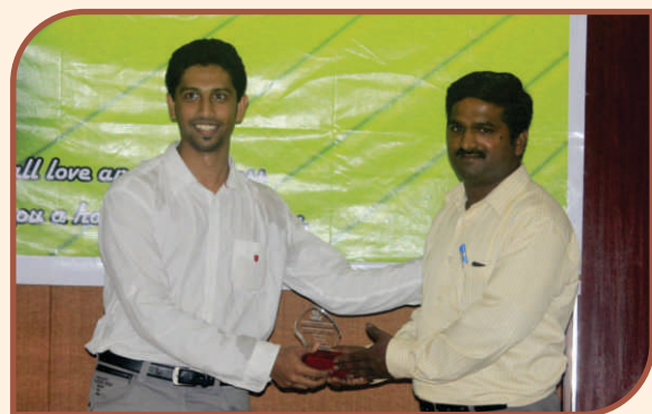
Student’s Honouring the Teaching & Non-teaching Staff with Memento

“A professor is someone who talks in someone else's sleep” - W. H. Auden