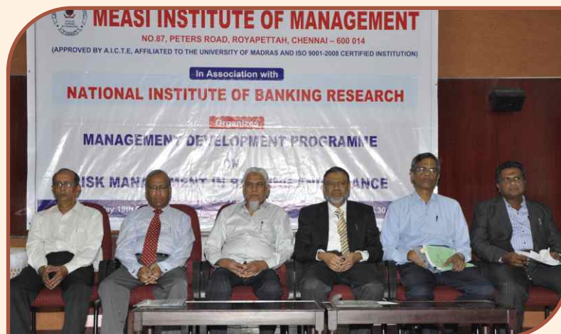
Inauguration Session of MDP